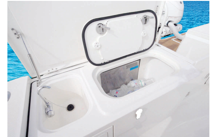
Bait Prep w/ FW Sink & 30 Gal Livewell w/ Shurflo 1100 GPH Pump