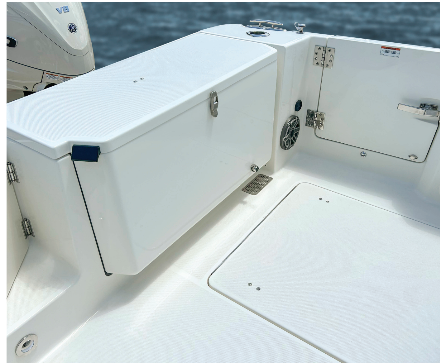
200 Qt Insulated Fish Box Port or Starboard (pictured on port side)