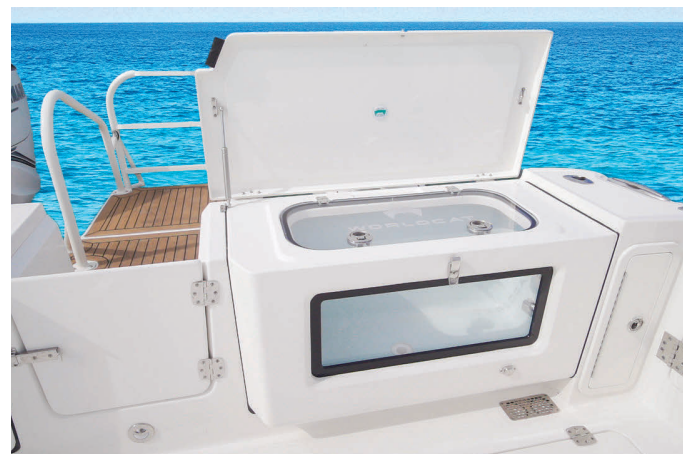
60 Gal Aquarium Livewell w/Shurflo 2000 GPH Pump