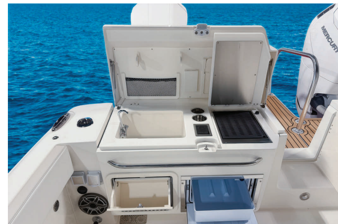
Summer Kitchen-Sink, Electric Grill and 36-Liter Fridge