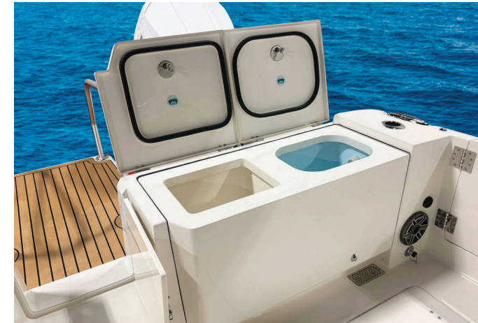
Combination 30 Gal Livewell w/ Shurflo 1100 GPH & Drink Box (no chill plates)