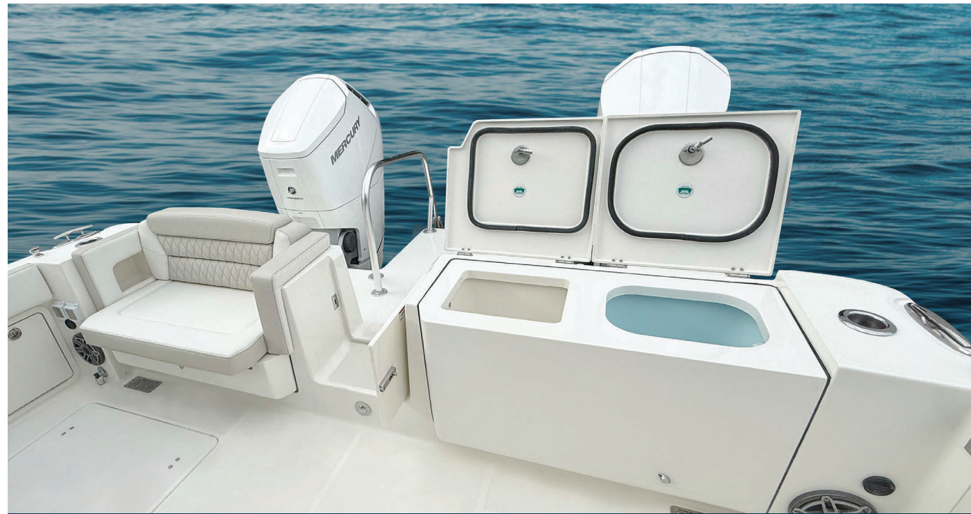
(Standard) Port and Starboard Molded-in Transom Seats (starboard side only pictured)